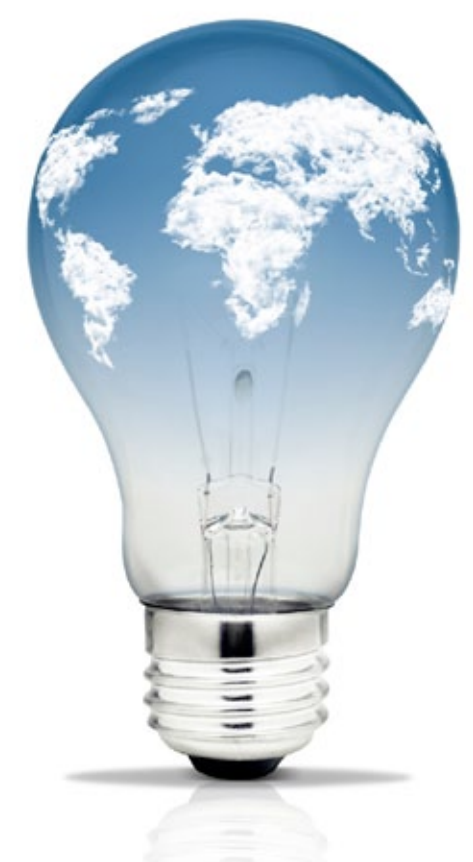
"Responsive, co-operative and knowledgeable." Chambers & Partners 2015